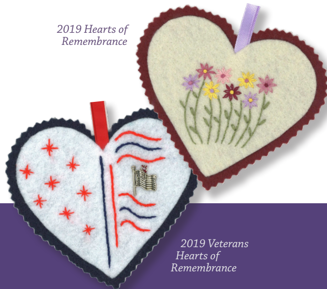
2019 Veterans Hearts of Remembrance